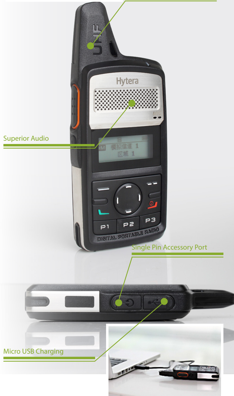
Micro USB Charging