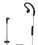
Earset C-Type In-line Speaker / MIC EHS16