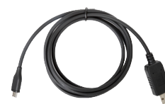
Programming Cable (Micro USB / USB Port) PC69