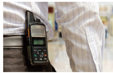
Pocket Size Design